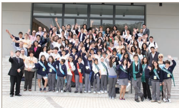
SABIS® STARS Participants

The SABIS® STARS (Student Life Talent and Academic Regionals) Competition was held in the Levant Region, also known as the Eastern Mediterranean, on April 9-10, 2010 at SABIS® International School-Adma (SIS-Adma). Having had success in its first year, when it was held in the U.A.E. for SABIS® schools in that region, SABIS® STARS is becoming popular across the SABIS® School Network.