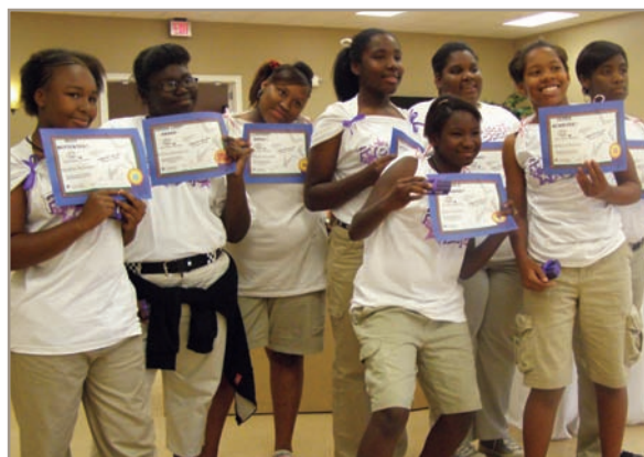
LPCS Students Awarded for Participating in Project 5210

The project, organized by the LPCS Student Life Organization, is entitled 5210 for its message which stresses 5 servings of fruits and vegetables each day; a daily 2-hour limit of screen time - television, computer, or video games; 1 hour of physical activity every day; and 0 tolerance for alcohol, tobacco, and