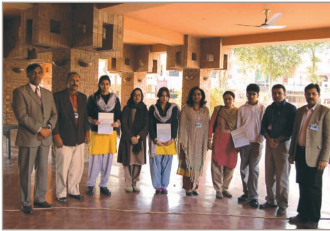
ISC-Lahore Students Honored for IGCSE Exam Results

Seventeen students in the SABIS® School Network recently received recognition for their remarkable results on 2009 British-based external examinations. Seven students from ISF Internationale Schule Frankfurt-Rhein-Main, three students from The International School of Choueifat-Lahore, two students each from The International School of Choueifat-Cairo, The International School of Choueifat-Dubai, and The International School of Choueifat-Amman, and one student from The International School of Choueifat-Abu Dhabi were distinguished with awards. Students who receive an award do so for either being among the top ten scorers on an exam in a subject in their country/region or for earning the best exam score in a subject worldwide.