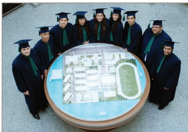
ISC-Manama's First Graduating Class

Attesting to the school's success, ISC-Manama graduated its first class of students in July 2010, all of whom have been accepted to colleges next fall. Students have secured spots at prominent universities such as, University of Tampa and Southern Methodist University in the U.S. and, University of Surrey and City University London in the U.K.