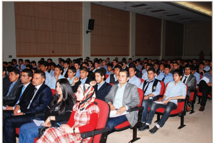
SABIS® University Recruitment Conference