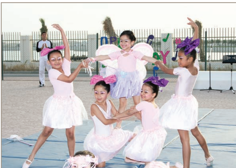
ISC-Manama Students Enjoying an Extracurricular Activity

ISC-Manama's Student Life Organization has experienced steady growth over the last four years. An integral part in equipping students with experiences and skills through clubs and extracurricular activities, ISC-Manama's SLO™ is a valued aspect of the school. As such, ISC-Manama's SLO™ has been sending student leaders to represent the school at the annual SLO™ Training Camp in Egypt. "Friendship, networking, and new ideas have resulted from having attended the training camp," said an ISC-Manama student. "We have started many new clubs based on the fresh ideas that come from the training camps," he added.