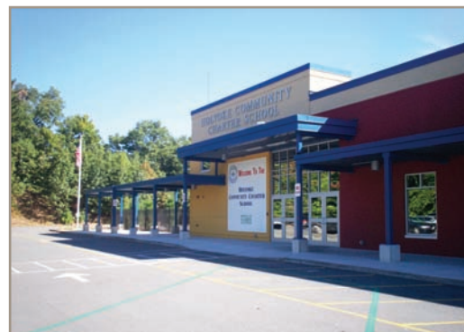
HCCS Main Entrance

In addition to operating private schools around the world, SABIS® is committed to contributing to the quality of education in the public sector. SABIS®'s involvement in the public sector began in earnest in 1995 with the establishment of its first charter school in the U.S. Since then SABIS® has been awarded the management of seven additional U.S. charter schools with one additional school to open in the fall of 2010. Each of the SABIS® public schools operates under a charter for a specific time period – usually three to five years – at the end of which the school must apply for a charter renewal. A charter renewal is then awarded based on the school's performance as well as on its success in meeting set objectives established in its initial charter.