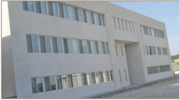
ISC-Amman's New Academic Building

Expansion among schools in the SABIS® School Network is an ongoing process as schools enhance their facilities or expand to accommodate the growing number of students they serve. Most notably, the International School of Choueifat-Amman, Jordan, and The International School of Minnesota, U.S., have recently or will soon experience a major expansion of their campuses.