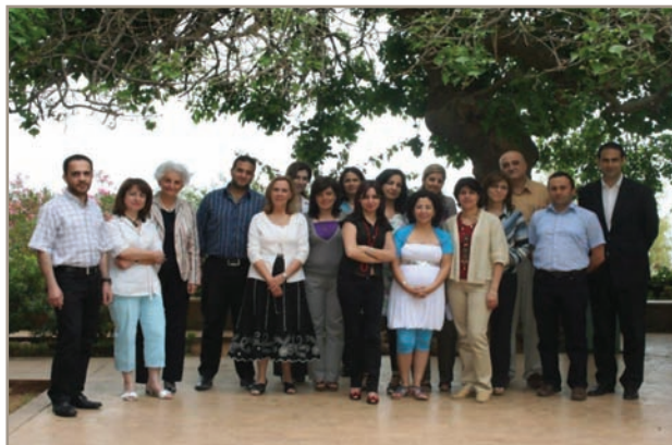
SABIS® Educational Services and Lebanon Regional Center's Academic Teams at ISC-Choueifat

Maintaining the high-standards of the SABIS® curriculum and ensuring its successful implementation, the SABIS® Academic Development Department recently held a series of workshops for the organization's Regional Centers. Carried out from March through May 2010, the Academic Development Department, which is responsible for continuously reviewing, updating, and developing the curriculum, carefully planned workshops that were tailored to each region to meet the individual needs of schools they serve.