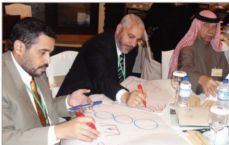
PPP Administrators Participating in Teamwork Activity

SABIS® was selected from among several education providers to be involved with the program. As the program has evolved and proven effective in mobilizing the knowledge and resources of the private sector for the improvement of public education, the scope of the project has expanded. Notably, the six schools originally awarded to SABIS® have since grown to 32.