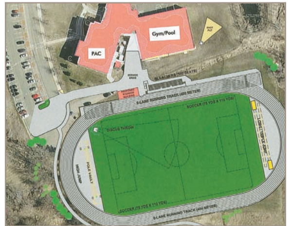
ISM's Future Soccer Pitch and Track

The International School of Minnesota (ISM), the first SABIS® school to operate in the U.S., opened its doors in 1985 and now serves over 600 students in Pre-K to Grade 12. Celebrating its 25 th year in operation, ISM has marked the occasion by significantly expanding its sports facilities. Construction has just kicked off on a new soccer pitch and track that will be equipped to support a variety of field sports including high jump, long jump, triple jump, discus, shot put, and pole vault. "We are looking forward to the completion of the new facilities in May of 2011 and are confident that it will serve to further enhance the ISM/SABIS® education experience," said ISM Director, Mrs. Sue Berg.