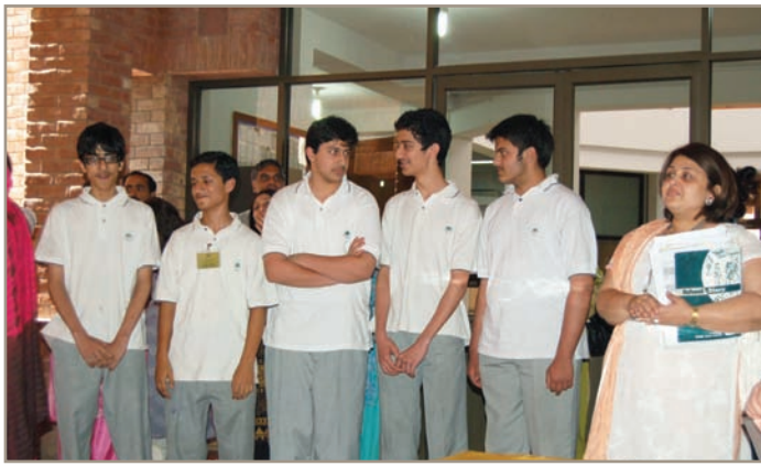
ISC-Lahore Olympiad Participants

and physics, among others, the ISC-Lahore team placed second among the 150 institutions participating. Overall, ISC-Lahore students were praised for their science and mathematics prowess as they tackled problems that were at a difficulty level of a first-year university course and higher.