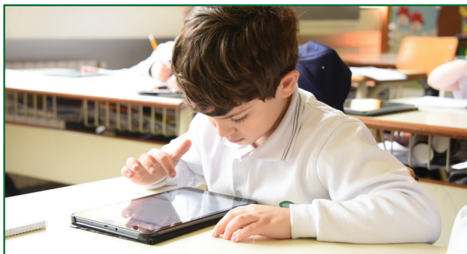
A SABIS® student using his E-book in the classroom

Since 2012, SABIS® schools around the globe have embraced E-book technology to enhance students' learning experience. SABIS® E-books include several engaging E-features that help enhance student learning such as a glossary, animations, dictionary, audio files, note-taking capability, bookmarking, and much more. Today, SABIS® is pleased to announce new developments for an improved and highly-secure SABIS® E-book application.