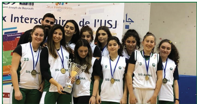
SIS-Adma girls futsal team take first place at local competition

SIS-Adma students take part in a wide range of sports including basketball, football (soccer), volleyball, athletics, and swimming thanks to the outstanding campus facilities. School teams compete in school, national, and regional competitions, bringing home various championships!