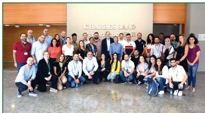
SLCs pose for a group photo with SABIS® President Carl Bistany

Over the course of a five-day training, 35 SLCs from 34 SABIS® schools around the world attended the conference, which sought to improve their leadership, knowledge, and team building skills. The agenda included in-depth academic training and interactive workshops on a number of topics such as leadership, proper use of IT tools, and goal-setting. SLCs also participated in brainstorming sessions to resolve common issues that schools experience.