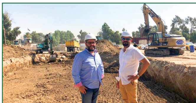
CADMUS® Iraq Gate groundbreaking

students for the new academic year. If you would like to know more about SABIS® Campinas, visit sabiscampinas.sabis.net or contact sabiscampinas@sabis.net . You can also follow them on social media by visiting SABIS® International School – Campinas.