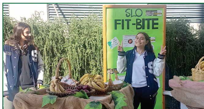
Sports and health department prefects at SIS-Adma provide students with a "Fit-Bite"

The Activities Department is another department that also organizes many events on campus including live art competitions, mothers’ day events, movie nights, barbeque nights, and much more!