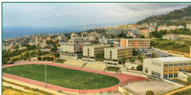
SABIS® International School – Adma campus

We are pleased to feature SABIS® International School – Adma (SIS-Adma) in this issue. Established in 2005, SIS-Adma is celebrating its 15 th anniversary this year, and it is clear that the school has quite a lot to celebrate!