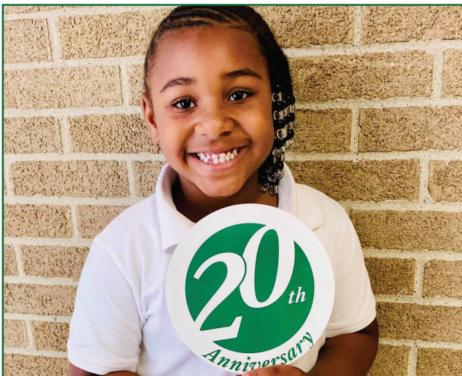
A young IAF student on her first day of school at IAF