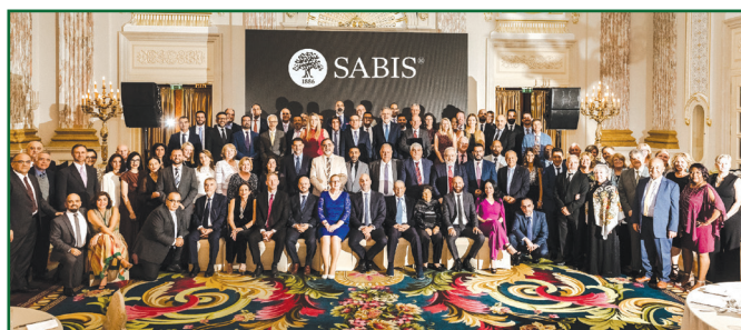
Group photo taken at the 2019 SABIS® Global Leadership Conference

The SABIS® Global Leadership Conference, formerly known as the SABIS® Directors' Meeting, was hosted this year in the historical city of Kiev, Ukraine. Close to 100 members of SABIS® senior staff in key positions across the network gathered for a 3-day conference from July 4 to 6, 2019, under the theme Leadership with a Focus .