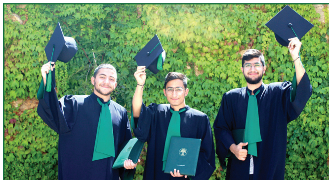
A group of students from the graduating Class of 2019

This summer was an especially significant one for the Leila C. Saad SABIS® School El-Metn . The school, which opened in 2012, celebrated the graduation of its first cohort of students. The Leila C. Saad SABIS® School El-Metn is one of the first tuition-free, private schools for low-income families in Lebanon. With an initial enrollment of just 20 students, SABIS® School-El Metn currently educates 339 students in KG2 through Grade 12, many of whom have had no access to formal schooling. The school delivers a high-quality education that emphasizes a balance of academics and opportunities for self-exploration and development.