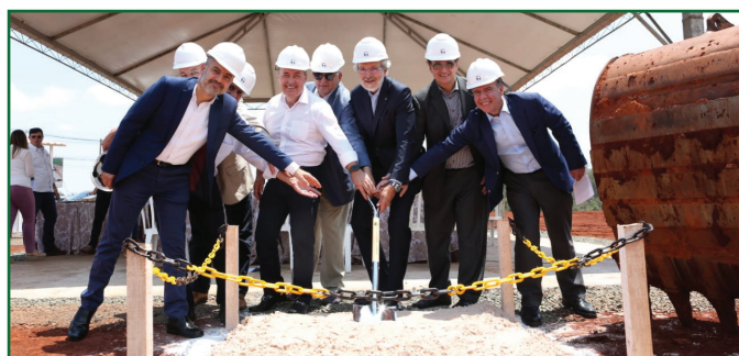
Brazil groundbreaking ceremony