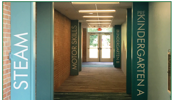
The Louisa Proctor Early Childhood Education Center at The International School of Minnesota