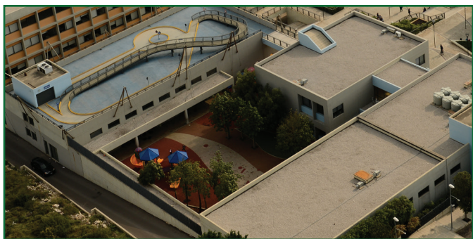
SIS-Adma KG building