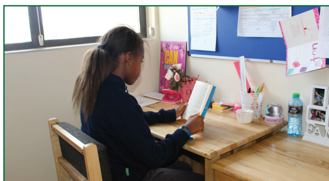
A SABIS® Runda boarder settles down with a good book in her dorm

SABIS® International School – Runda (SABIS® Runda) is located on a 20-acre, state-of-the-art campus and is the first SABIS® school to operate out of West Africa. SABIS® Runda provides students in Nairobi with the perfect setting to explore their talents, develop their interests, and discover their dreams. Today, SABIS® Runda is proud to announce the latest expansion to their campus, a new, purpose-built, residential hall.