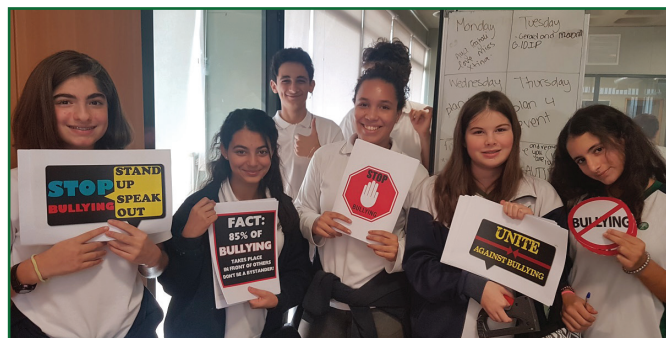
SIS-Adma prefects promoting antibullying campaign

children feel that they are being bullied in any way. The Outreach Department prefects organize events that aim to spread joy and kindness throughout the school.